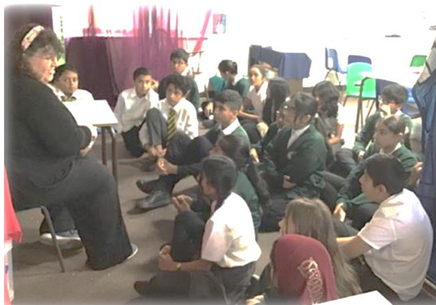
Talking to the class to see what they have thought about and found out during ExploRE