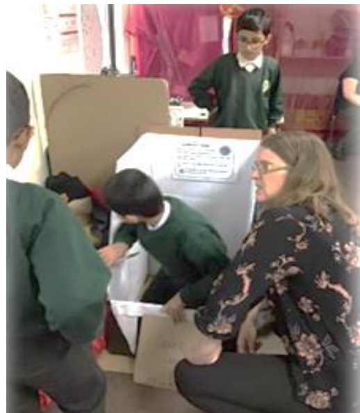
Talking about homeless people