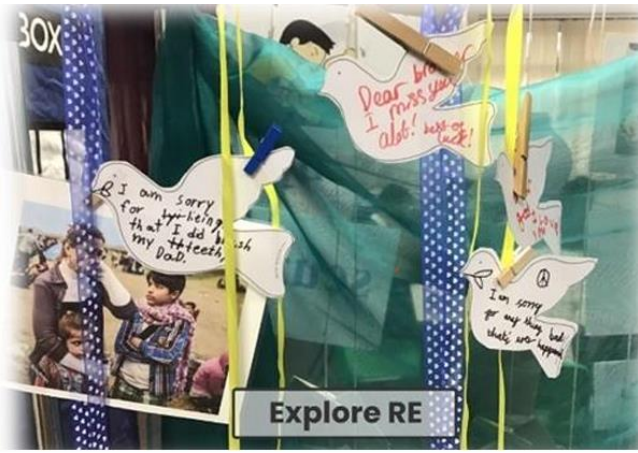
Making doves of peace