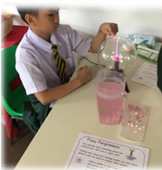
Thinking about forgiveness

Maybe you'd like to come and see ExplorE in action or if you'd like to volunteer to help? Please get in touch!