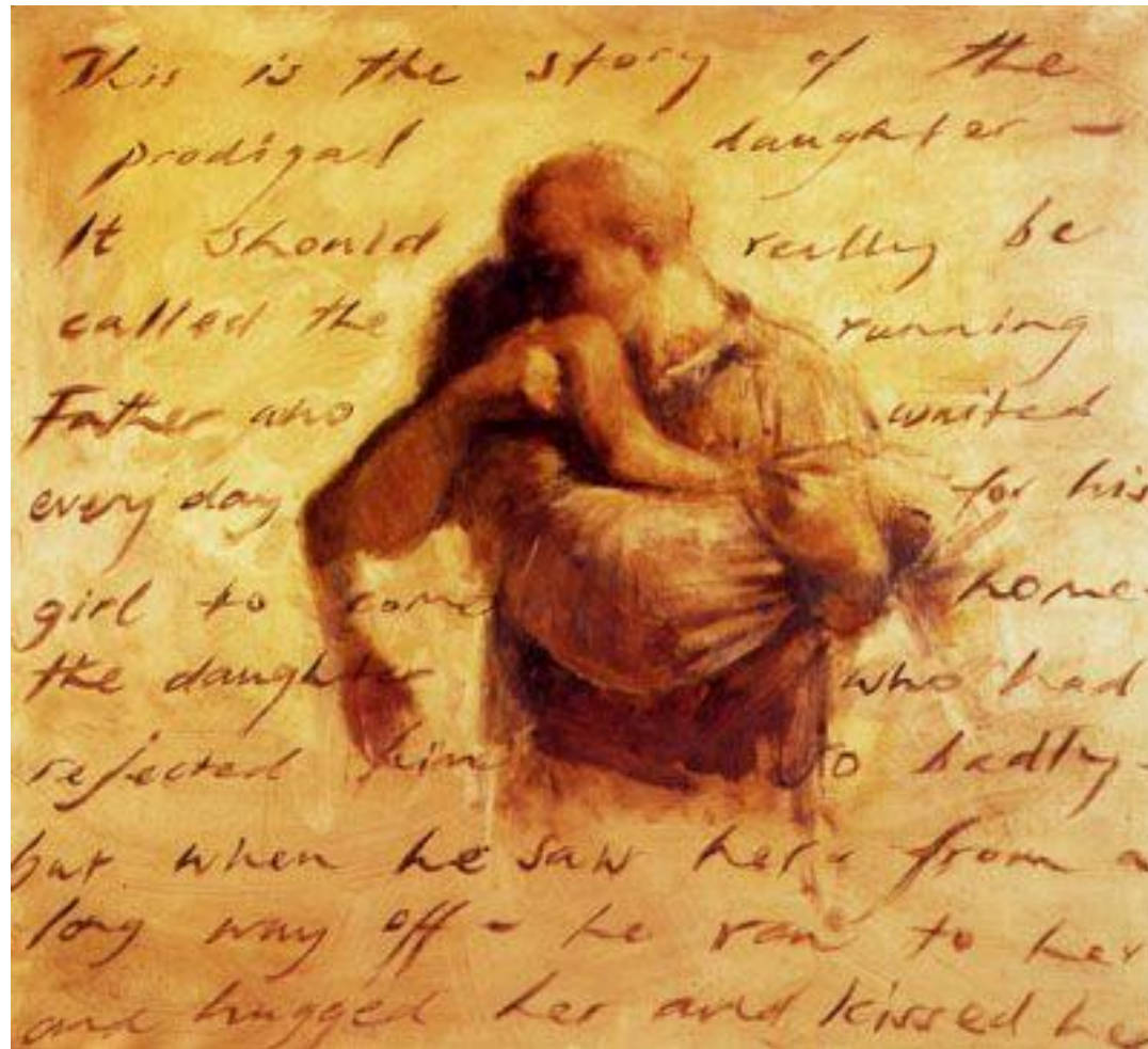
The Prodigal Daughter by Charlie Mackesy