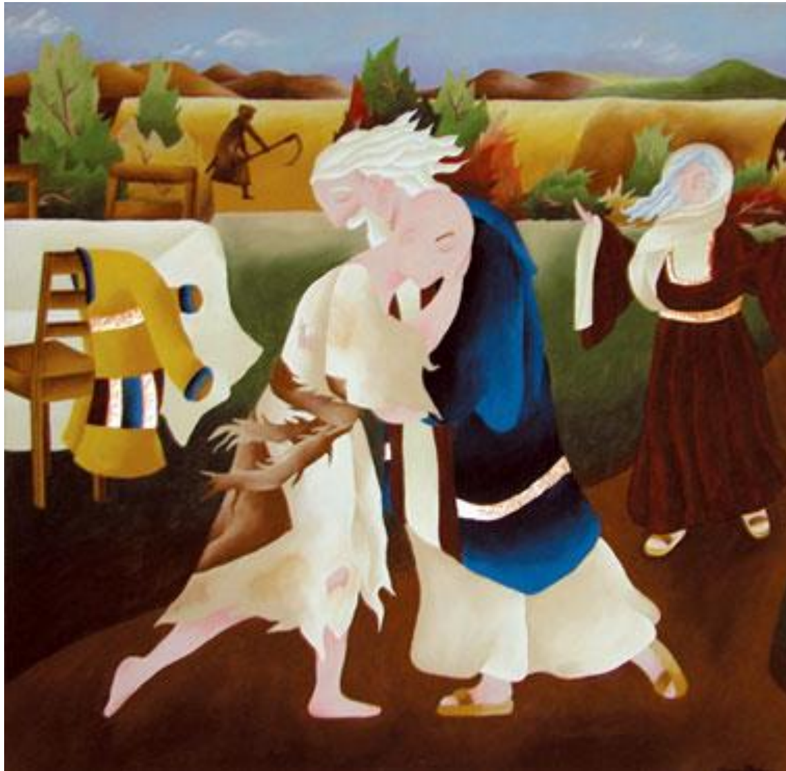
“The Prodigal Son” by Tamara Paetkau