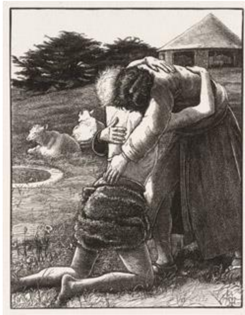
Parables of Our Lord -The Prodigal Son 1864 Wood engravings by the Brothers Dalziel