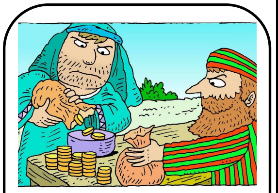
What words could you use to describe Zacchaeus before he met Jesus?